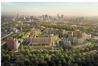
Cartesius, Utrecht, NL