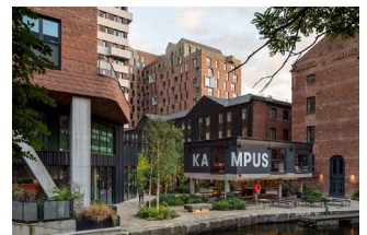
Kampus, Manchester, UK