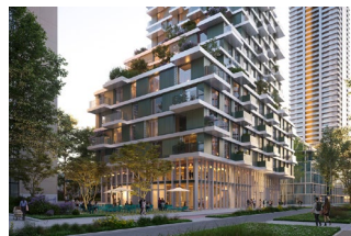
Vierlander, Eindhoven, NL