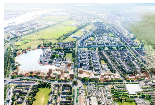
Thamesmead Regeneration Masterplan, London, UK