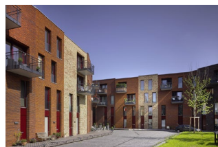
St. Josephhof Residences, Nijmegen, NL