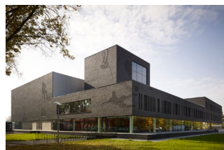
Fontys School of Sport Studies, Eindhoven, NL