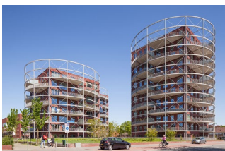
Villa Industria, Hilversum, NL